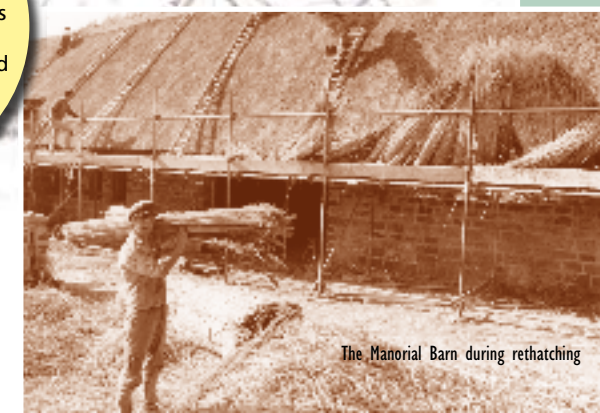
The Manorial Barn during rethatching

The barn originally consisted of 2 storage bays at each end divided by a central threshing floor. Additional bays were added to the northern end of the barn during the middle ages. A wheelhouse was also constructed to hold a threshing machine following the barn's purchase by Sir George Sitwell.