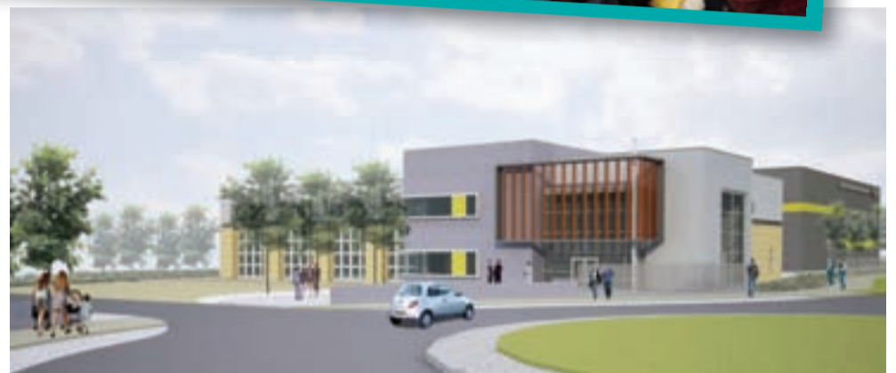
FASTER RESPONSE: a computer-generated image of how the new fire station will look