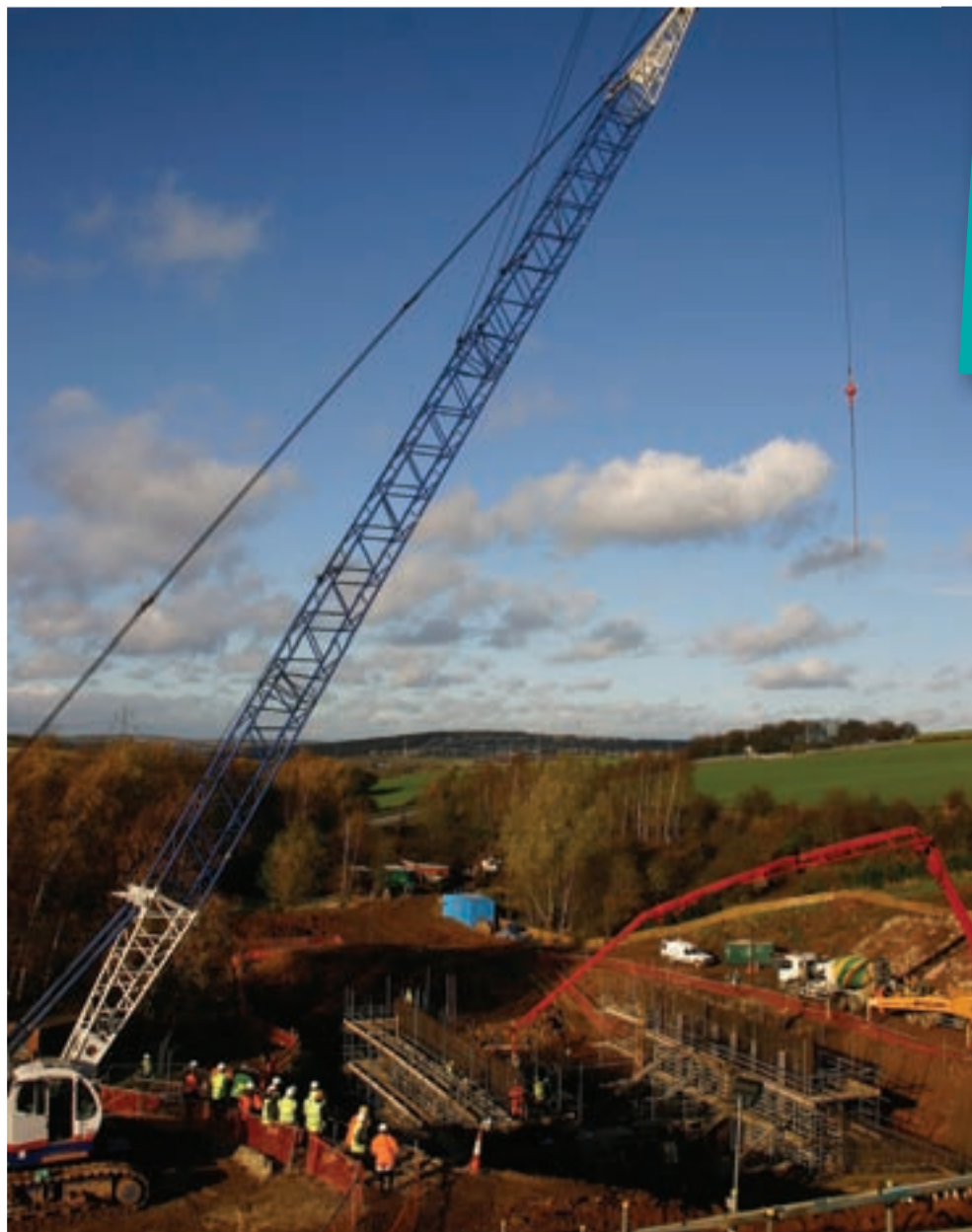
READY FOR SPRING: A £3.8 million scheme to repair Ulley Dam is now well under way after a scour hole was formed in the dam wall following torrential rain in June 2007

It is hoped the principal works will be completed by next spring but this will have to be followed by a period of monitoring to see that the dam performs satisfactorily, which in turn has to be certified by an external specialist reservoir engineer under the Reservoirs Act.