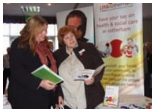
Visitors to the LINKrotherham stand during Carer's Rights Day

Find out more by visiting LINKrotherham's website - www.linkrotherham.org.uk