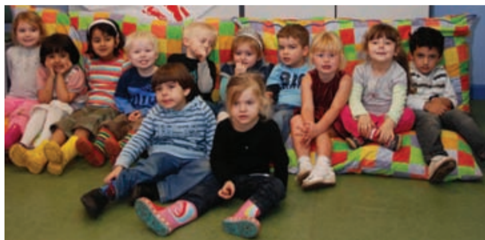
DESIGN WINNERS: Children from the Leapfrog Day Nursery at Rotherham General Hospital with their artwork designed to highlight the importance of protecting the environment

C hildren from the Leapfrog Day Nursery have been helping The Rotherham NHS Foundation Trust to highlight the importance of saving energy and looking after the environment.