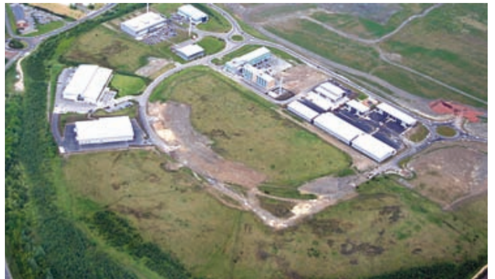
FLYING THE FLAG: The Advanced Manufacturing Park is one of the world's leading hubs for research and development, innovation, manufacturing and engineering

"The Advanced Manufacturing Park is a successful template for industry and university collaboration, so I am delighted to be here in Rotherham to see it working."