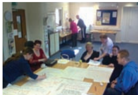
A previous Disability Awareness Training session

Do you really understand the needs of disabled people? Do you really care about the prejudices they face? Disability Awareness Training, Wednesday 20th January, 10.00am-12noon (at Voluntary Action Rotherham)