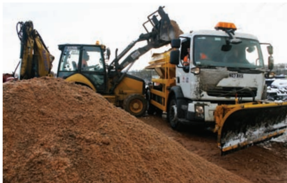
Rotherham Borough Council workers busy at work with the stocks of grit at the Greasbrough Road Depot, Rotherham

a bid to keep roads clear during the atrocious road conditions during and after the Christmas and New Year Break.