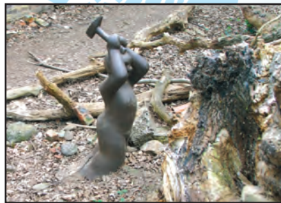
Figure E: Dukes Lane Statue