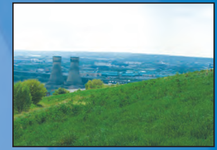
Figure A: View of Wincobank Roman Ridge