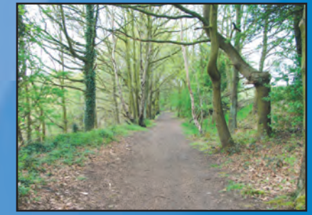
Figure D: Ockley Bottom Mineral Line