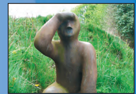
Figure B: Green lane Statue