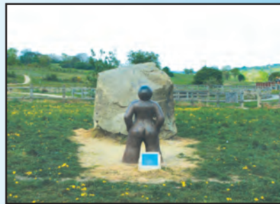
Figure F: Engine Ponds