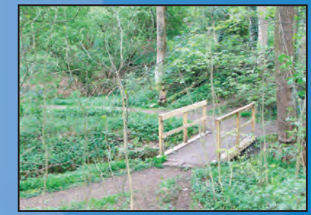
Figure C: Statue besides footbridge