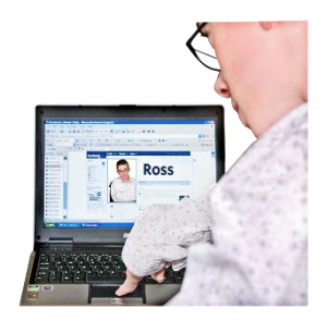
IT / web-based skills