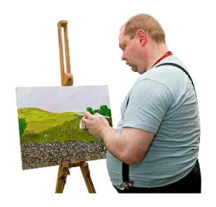
Arts and crafts