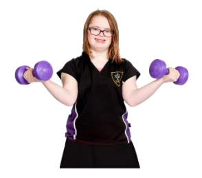
Exercise / gym