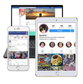
Social media / IT / gaming areas