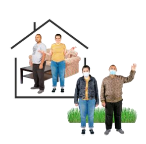
Access to outdoor areas