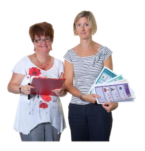
Information and advice