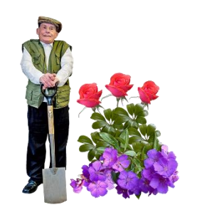
Gardening / allotment