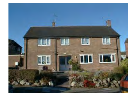
Rotherham Learning Disability Directory

Treefields is a detached 2-storey house, situated on the Wingfield estate, about 3 miles from Rotherham town centre. It is accessible by public transport and is within reach of local amenities. There are garden areas at the front and back of the house. The side and rear grounds are fenced off. The back garden provides a patio area with garden furniture.