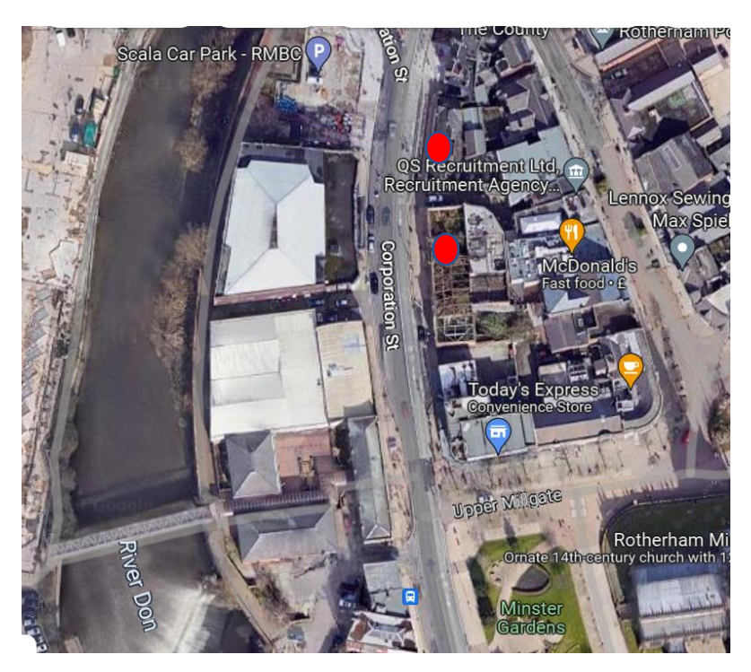
Figure 2: Location of 3-7 Corporation Street (Red Dots)