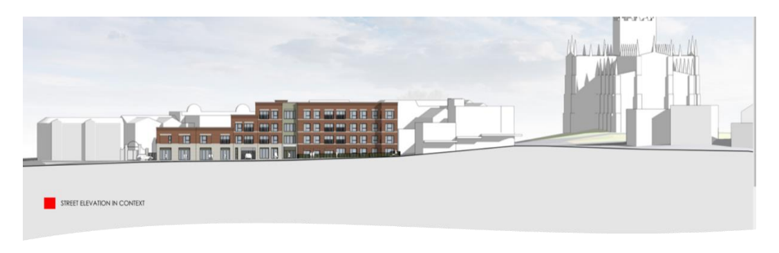
Figure 1: Visuals for proposed development (AHR Architects, Planning Application Submission)