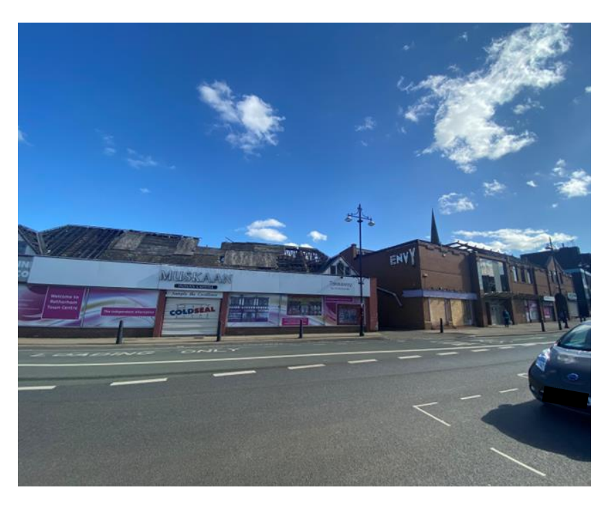
Figure 3: Current derelict state of buildings on the Order Land