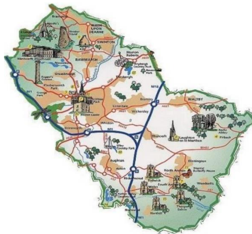
Rotherham Council Length of highway Network and PRowS (km)

The highway network that is managed by RMBC, represents the biggest financial asset that the Council is responsible for, it is therefore essential that it is well managed and maintained.