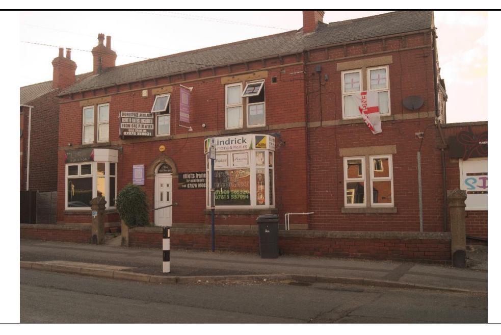
Dinnington St John's Neighbourhood Plan Supporting Evidence – Dinnington Character Buildings and Structures of Local Heritage Interest